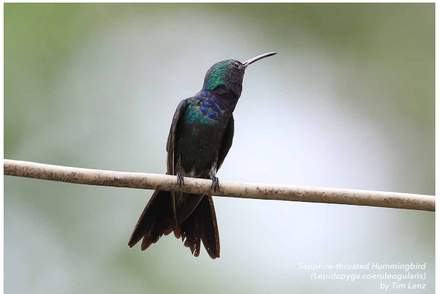
Sapphire-throated Hummingbird ( Lepidopyga coeruleogularis)