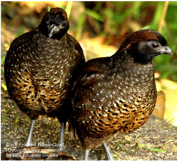
Black-fronted Wood-Quail ( Odontophorus atrifrons)