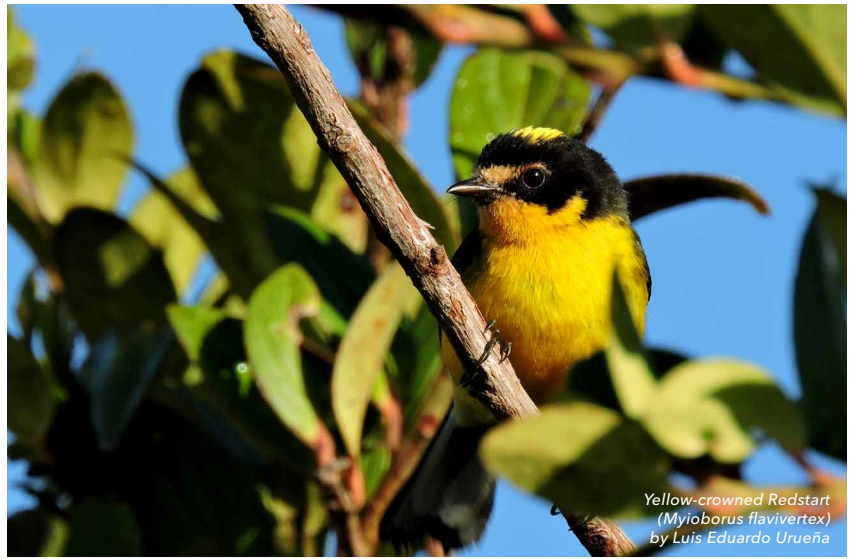
Yellow-crowned Redstart ( Myioborus flavivertex)